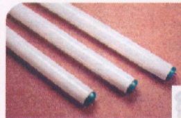
Traditional fluorescent lights