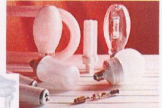
Compact fluorescent lights (CFL's)