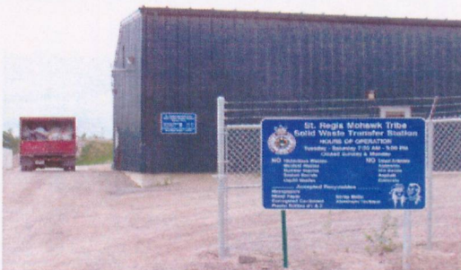
The St. Regis Mohawk Tribe Transfer Station

St. Regis Mohawk Tribe Solid Waste Management Program 412 State Route 37 Akwesasne, NY 13655